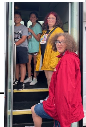
Our youth going with the El Reno youth to Chi Rho Camp!