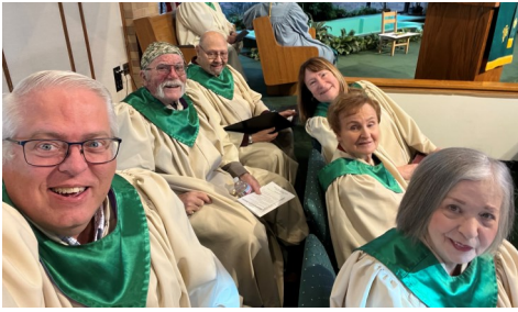
The Choir was caught having some fun taking a 'selfie' on Sunday, Feb 2, 2025.