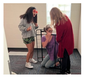
Rearranging sleeping rooms at South Hill Christian Church in Fort Worth