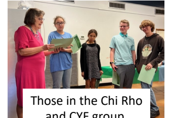
Those in the Chi Rho and CYF group.