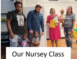
Our Nursesey Class